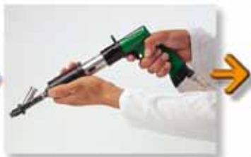
Semi-automatic (manual) loading of screw on screwdriver bit