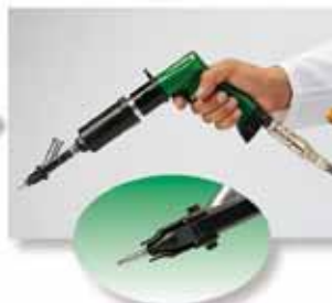
The screw is loaded