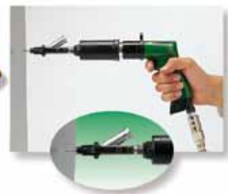
Positioning of the screw in the driving area