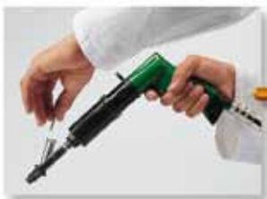
Manual screw loading